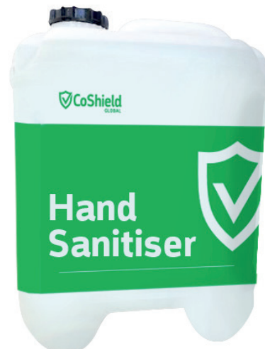
20L Drum - SHS20000L