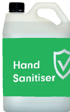
5L Drum - SHS5000L