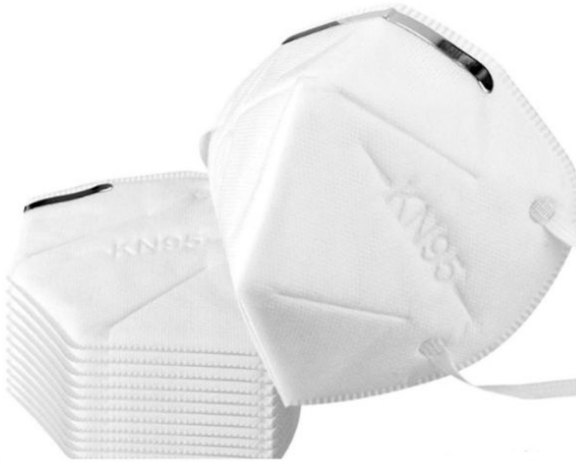
KN95 Protective Face Mask