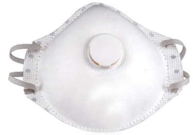
N95 Particulate Respirator Mask